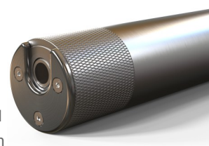
Fig 2: Sensor with AutoClean Cap

Click here for a video on sensor cleaning options from Pi.