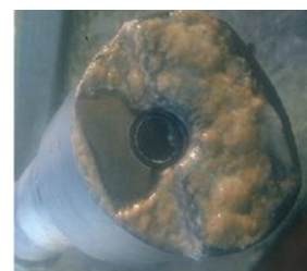
Fig 1: Sensor Fouling

Whatever the process being monitored is, there is often something in the sample water capable of fouling a sensor as shown in Figure 1, and therefore causing erroneous results. The obvious solution to this problem is to clean the sensor, but how frequent should inspection and cleaning programs be for each piece of instrumentation? Too frequent and the inspection and cleaning regimen is time consuming and unnecessarily costly. Not often enough and the instrumentation will give false results and possibly fail prematurely.